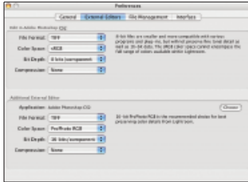
Figure 3. These preferences control the color space, bit depth and file format when images are edited in an external editor. Online help provides useful guidance about the options*.

If you import rendered RGB images to Lightroom and make no edits, the images will retain their original color spaces. In short, Lightroom can be used as a Digital Assist Manager for existing rendered files. If you wish to simply open the file in an external editor like Photoshop, the original color space is retained. However, if you wish to export a file edited in Lightroom, the Export dialog must be set to create a copy first. Lightroom will build the copy of the original rendered image and place it into its database with "edit" appended to the file name (Figure 2). The exported copy will then be converted into the color space you selected